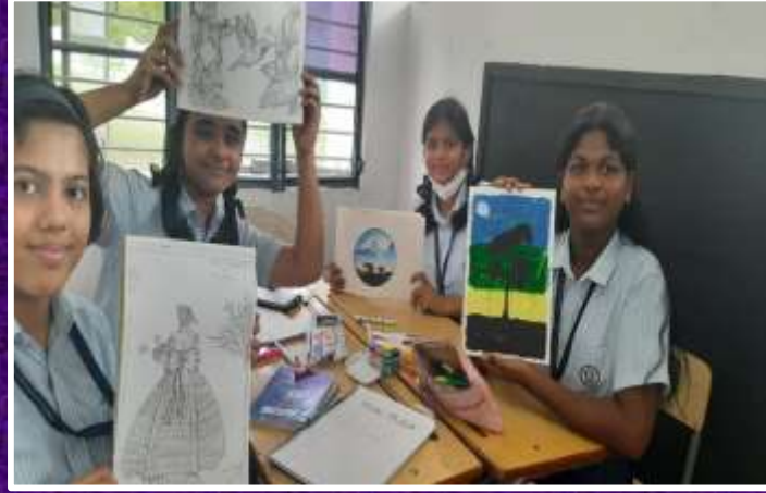
Pencil shading and Poster colour painting by students of Arts club on 01 Aug 23.