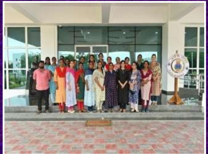
Teachers and staff visited Air station on 03 Aug 23 and 14 Sep 23.