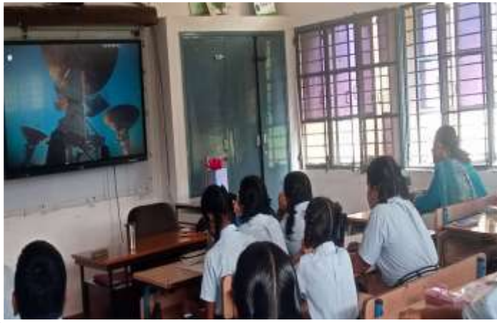
Screening of movie on “Innovators and Innovations” to students of Innovative club on 18 Jul 23.